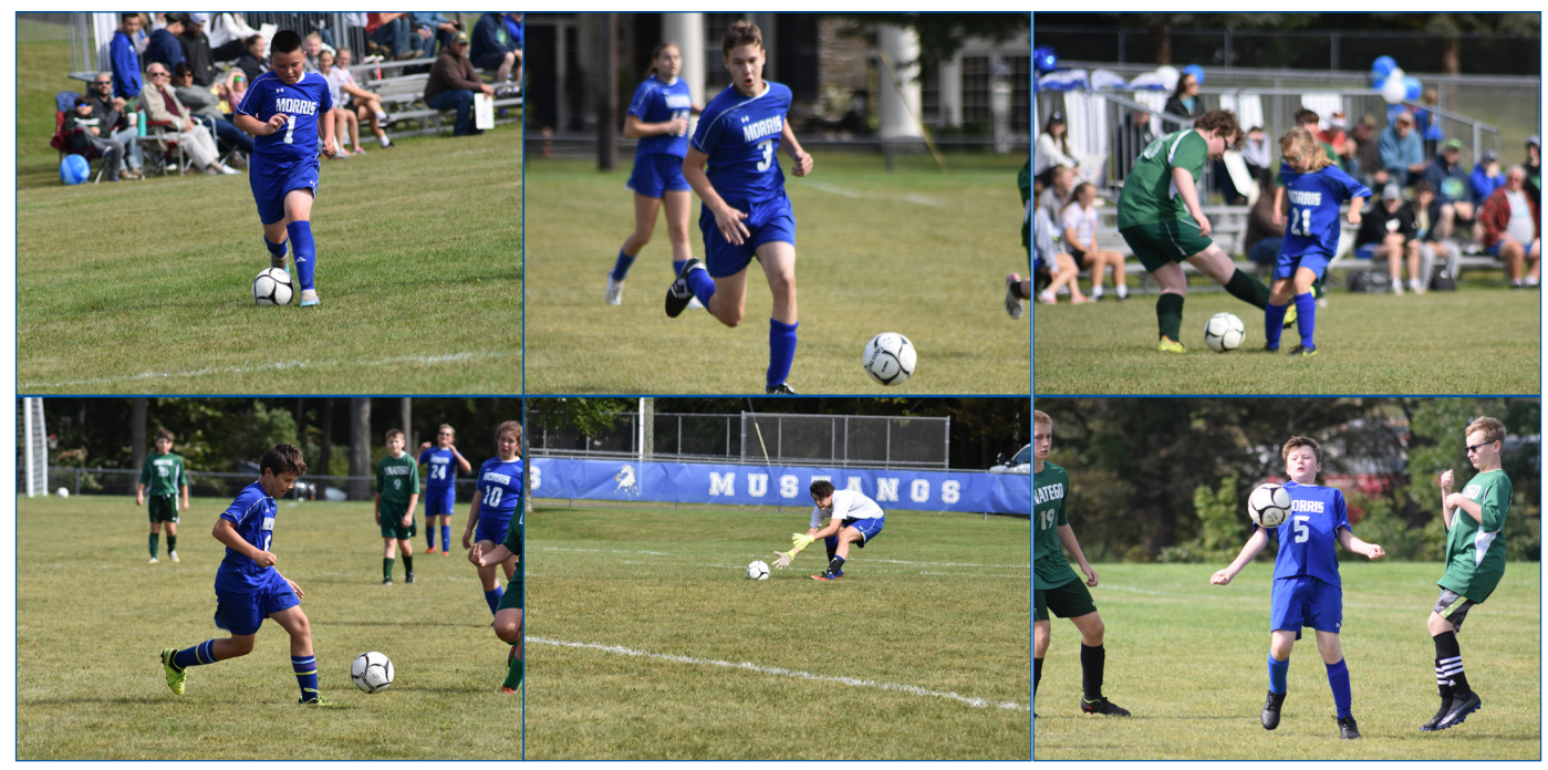
Boys' and Girls' Varsity Goccer