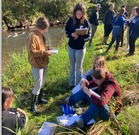
Testing dissolved oxygen