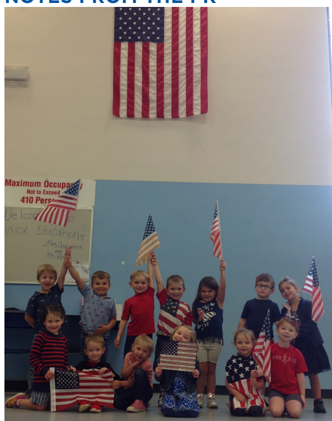
Our PreK students learned about the American Flag and they are learning the Pledge of Allegiance!