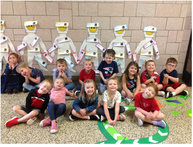
Our PreK students learned about the parts of our bodies the first weeks of school.